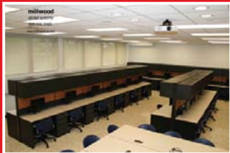
Grand Opening of the New Lab (5-5-2010)