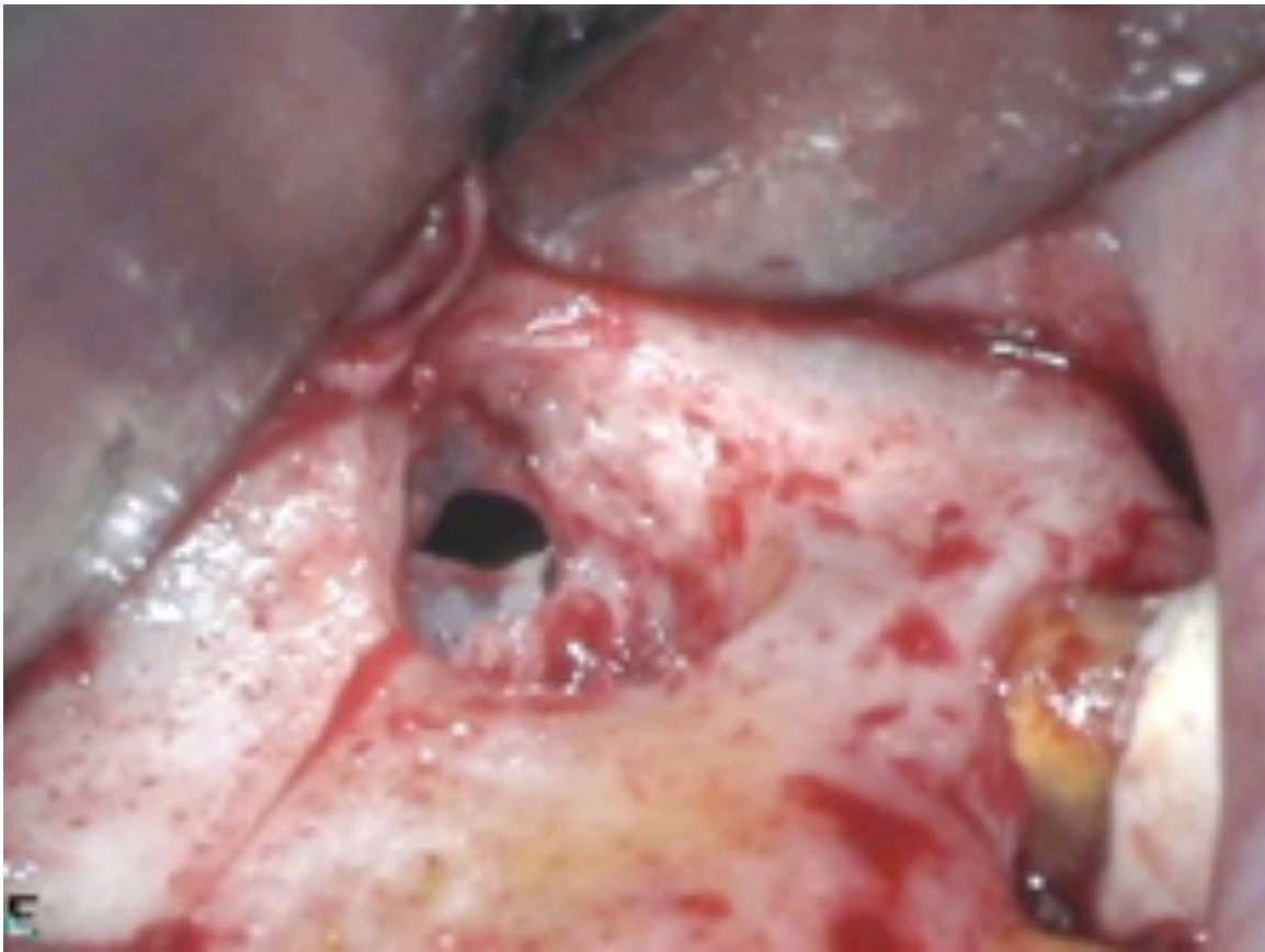
FIGURE 1: SINUS PERFORATION